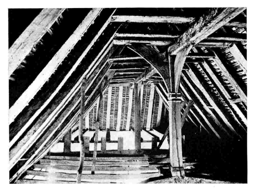
a.\, The roof-structure over the east range looking south, showing the open truss No. 7 and, beyond, the closed truss No. 8.